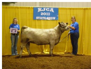
Champion % Female