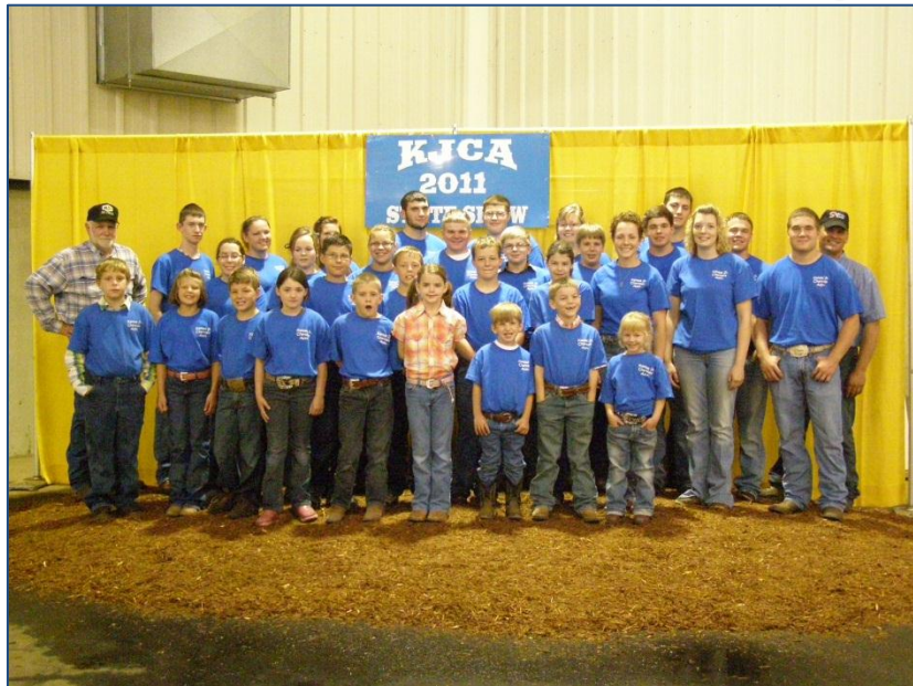
2011 State Show Participants

(Please see attached word document for complete listing of results)