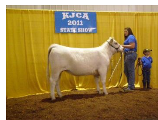
Reserve % Female