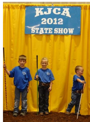
Pee Wee Showmanship

Congratulations Juniors on a Terrific State Show! Thank you to all of you who helped with the event and/or sponsored it. You are appreciated!