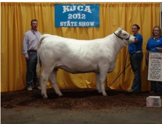
Reserve Female Reserve Bred & Owned Female