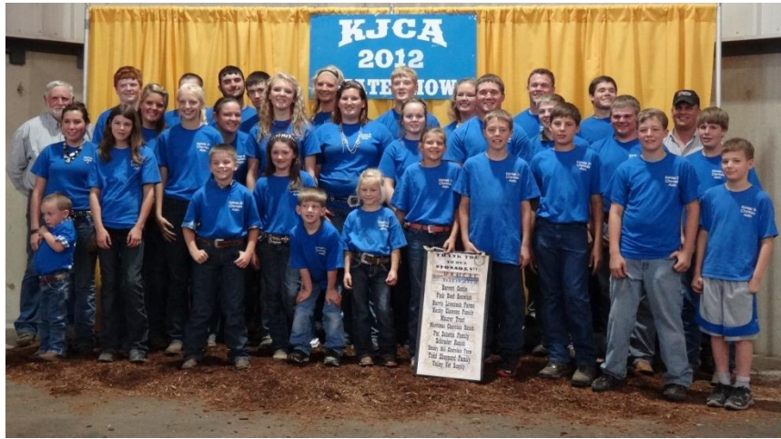
2012 State Show Participants