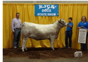
Reserve % Female