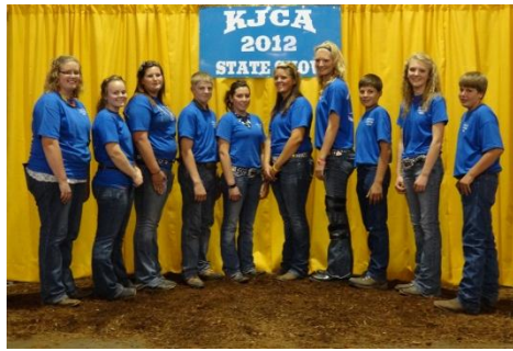
2012 KJCA Officers