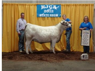
Champion % Female