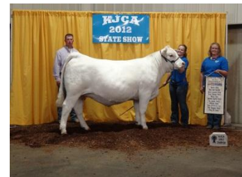
Champion Futurity Female